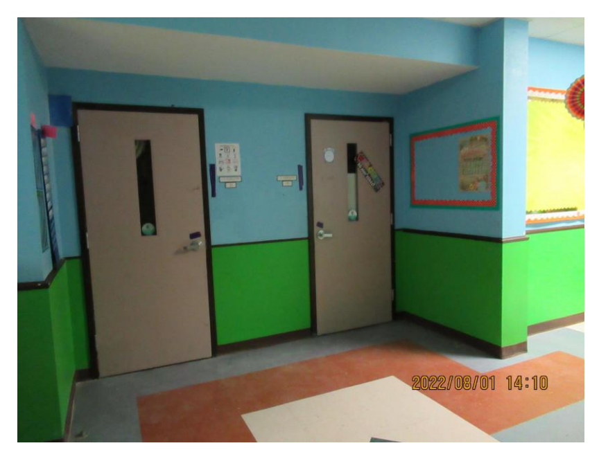
Example of dark classroom